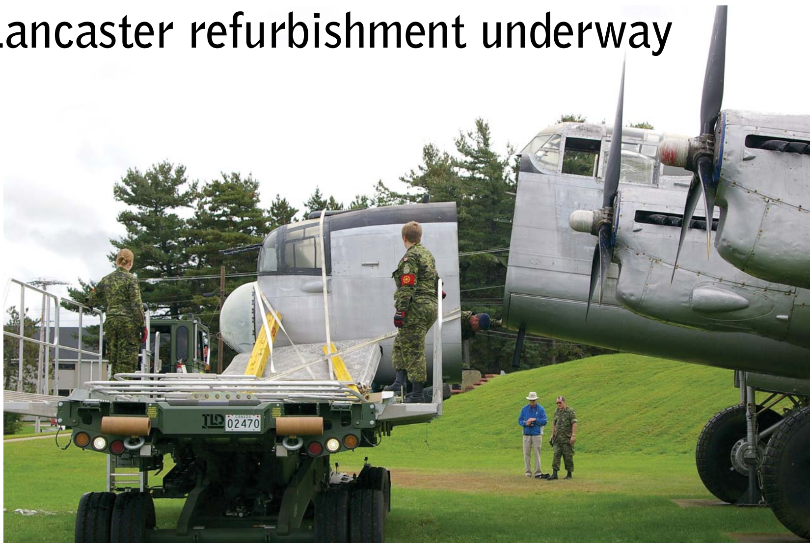
14 Wing Greenwood's Air Movements Unit crews took care of the heavy work, moving the Lancaster's nose across the base.

Keeping with the museum's mandate to honour the history of Greenwood's squadrons, and accurately portraying a Lanc flown by 405 Squadron in the Second World War, some major reconstruction has to be made. Firstly, the nose has to be shortened by 40 inches to its original configuration. Post-war, the Lanc was used in many different roles, one being the continued mapping of Canada by aerial photography – necessitating a longer nose to house up to 10 cameras. Only three Lancs were converted with the elongated nose: KB839, KB882 (Edmunston, NB) and KB976 (Florida). Secondly, the rear gun turret will be repaired and a new