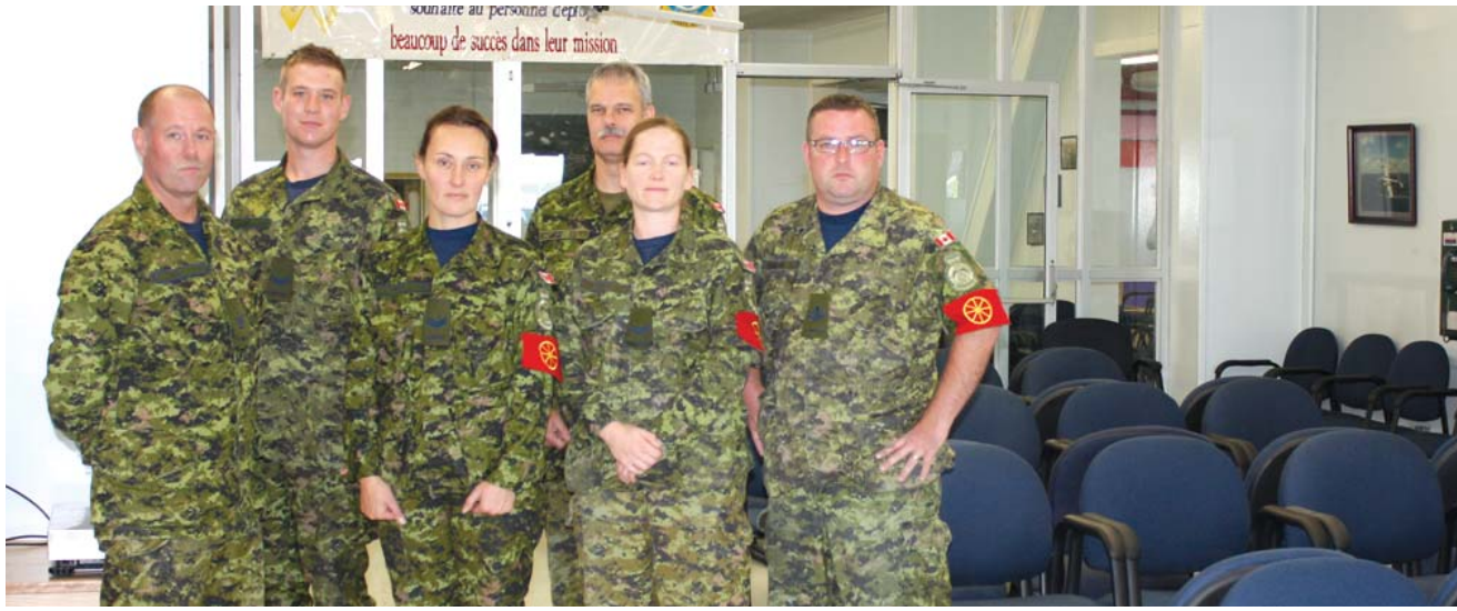
14 Wing Greenwood's Air Movements Unit personnel are ready to send travellers on their way, through the refurbished terminal. New safety, comfort and other additions to the space in recent months have made a big difference.