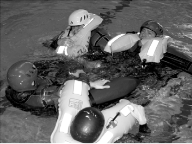
Participants raft up.