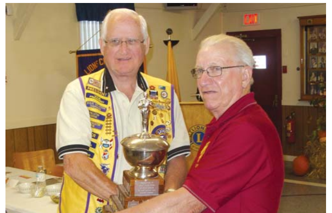
The N2 District recognized the hard work the members of the Kingston club put into providing service to their community by awarding them District Club of the Year for 2011-2012.

away! Since it is a masquerade ball we encourage you to wear masks or face paint etc... so no one recognizes you! There will be prizes for scariest, funniest, best over all and grossest costumes. There will also be a creepy scientist dropping by to give you a sneak preview of one of his latest creations. Admission $4.