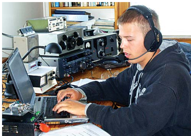
An amateur radio operator speaking with friends around the world. Submitted

Amateur radio is a hobby and public service provided by millions of people around the world fascinated by the magic of radio. Amateur radio operators, often called hams, are licensed to use a wide range of frequencies and operating modes, including voice, Morse Code, television and digital keyboard modes. The signals themselves can be transmitted around the world. Shortwave frequencies reach long distances because of the ionosphere in the Earth's upper atmosphere, but hams also bounce signals off meteor trails, the surface of the Moon and even their own satellites. Operators come from all walks of life, from high school students to Nobel Prize