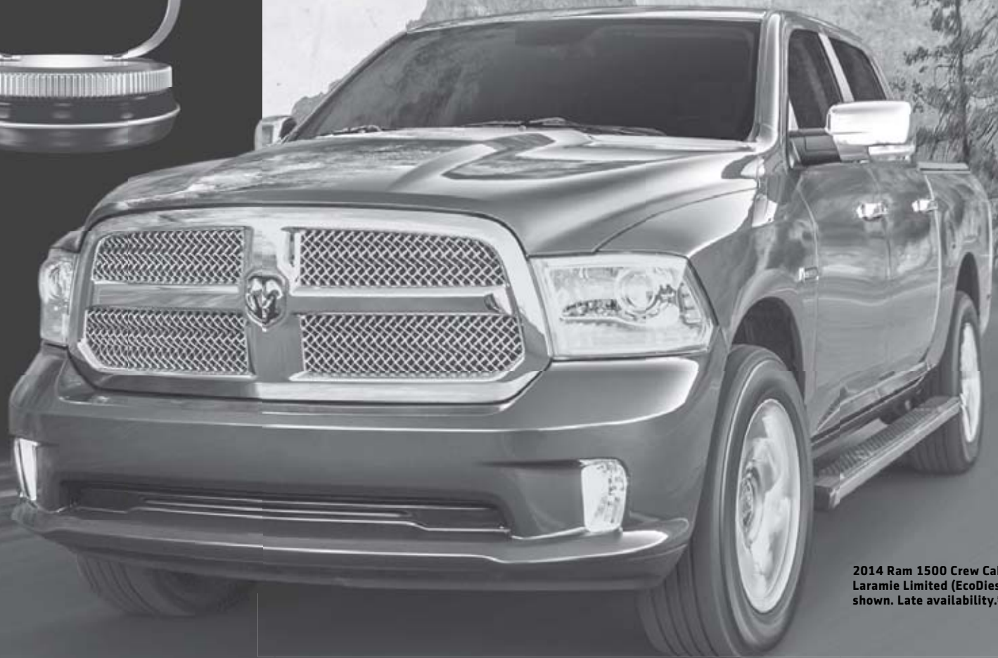
2014 Ram 1500 Crew Cab Laramie Limited (EcoDiesel) shown. Late availability.†

PURCHASE PRICE INCLUDES $8,500 CONSUMER CASH.*