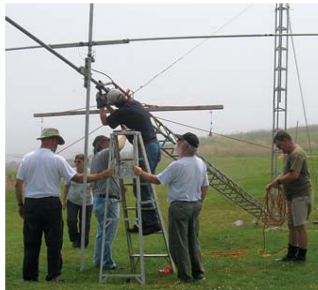
Amateur radio operators prepare to erect a tower on a foggy day.

The Greenwood club's course will be held Monday evenings, 7 p.m. to 9:30 p.m., at the 14 Wing Greenwood Community Centre, beginning January 27 and finishing April 28. The course is open to anyone and everyone (military and community members). The cost of the course is $65, which covers the textbook, photocopying and membership in the Greenwood club. Discounts are available for those who have a recent edition of the Basic Qualification Study Guide (Coax Publications), or who have several members of one family who can easily share a single textbook. The instructors are all experienced hams and have