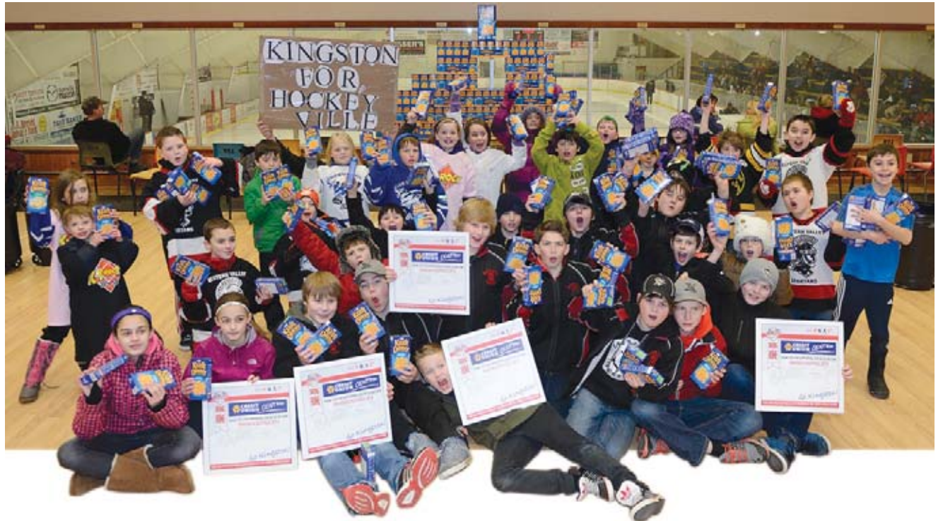
Hundreds of Kingston rink fans turned out to a Hockeyville bid rally January 10.

Hundreds of people turned out, Kraft Dinner in hand, to a rally January 10. Pictures, videos, shared stories and an ice sheet covered in KD boxes were all documented in the rink's bid for an NHL pre-season game, $100,000 in arena upgrades and a visit from CBC. Up to one million dollars will be shared among 16 hockey communities across Canada. The deadline for bids is February 9, and Kingston's bid needs