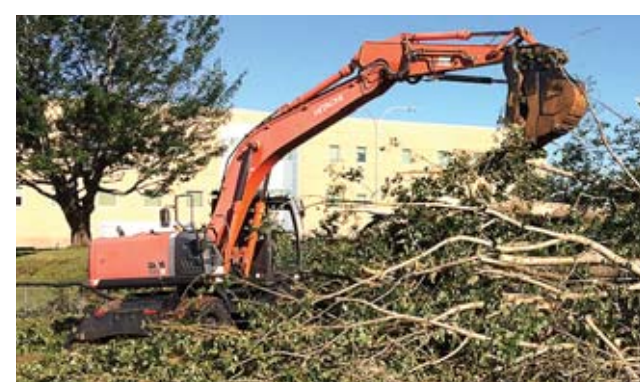
Crews worked September 9 to clear up a fallen row of poplar trees which, pre-Dorian, overlooked the base's ballfield.

September 10, as recovery work was underway, the wing's ability to take and place external phone calls were affected by regional phone service provider issues caused by the storm. The Greenwood Golf Course and CANEX both remained without power and closed September 12. →