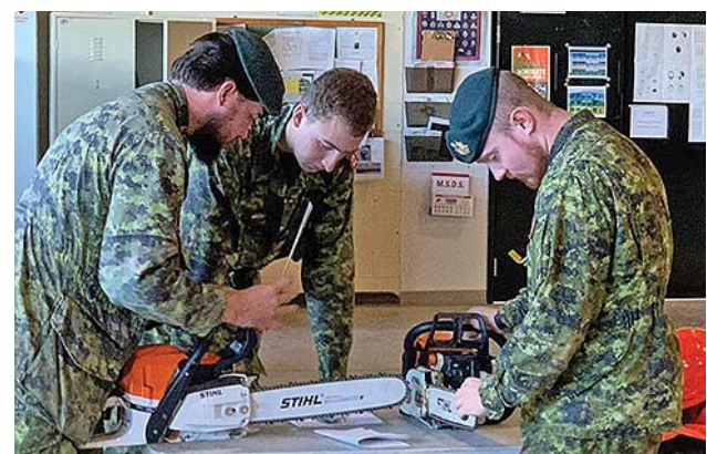
Some West Nova Scotia Regiment Pioneer-qualified soldiers shared some skills with others headed out on OP LENTUS relief tasks.

The 14 Wing Community Centre opened into the following week to the public, offering showers, charging and wifi, the gym for casual play and its kitchenette. The bowling centre offered free bowling and snacks Monday, and there was a steady stream of families dropping in, as Valley schools were closed. The 14 Wing Fitness & Sports Centre also offered showers, and the Greenwood Military Family Resource Centre opened its Ivy Room lounge for families looking for conversation and a coffee. The