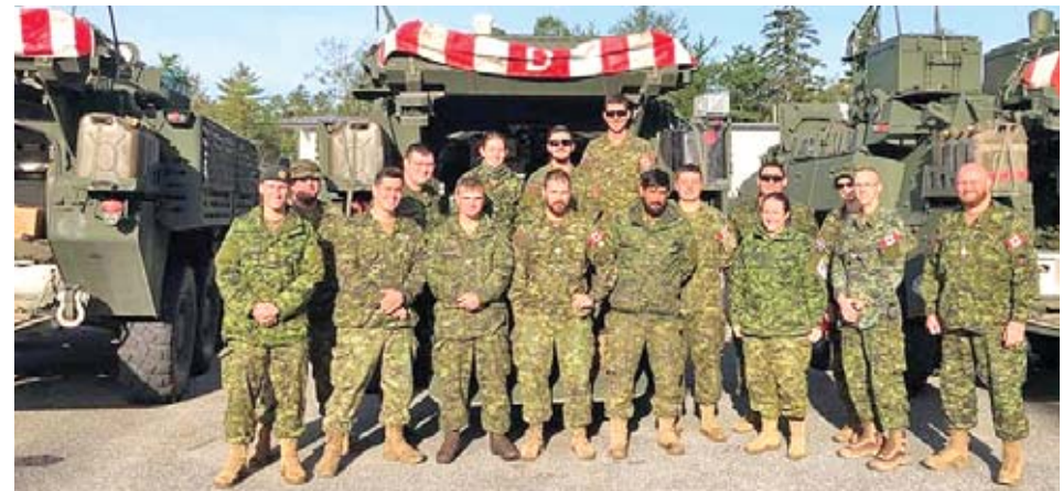
Members of 4 Engineer Support Regiment from CFB Gaagetown arrived along the South Shore September 9 to help with post-Dorian relief and clean-up efforts. The soldiers were hosted at 14 Construction Engineering Squadron HQ and made a significant difference with their equipment and dedicated members.