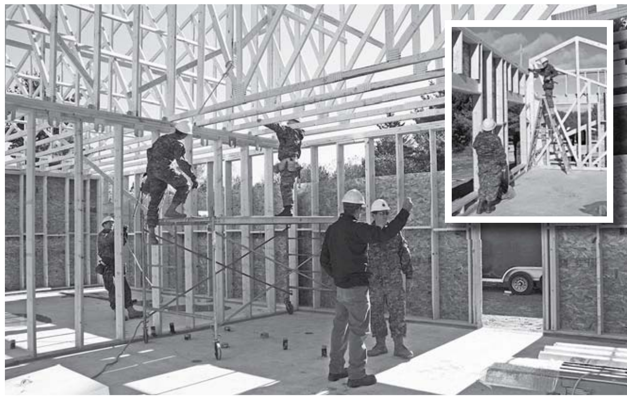
14 Wing Greenwood's Construction Engineering section is on site at the Lake Pleasant Campground in Springfield, building a new main lodge this fall. Raising the roof trusses for the cathedral ceiling October 3 was a milestone, as they hope to have the structure roof-tight by the end of November, and ready to open for the May long weekend.

The lodge is a 60-foot by 80-foot wood frame construction, with steel siding and roofing, and includes a multipurpose room, commercial kitchen, DJ booth, washrooms and a deck on