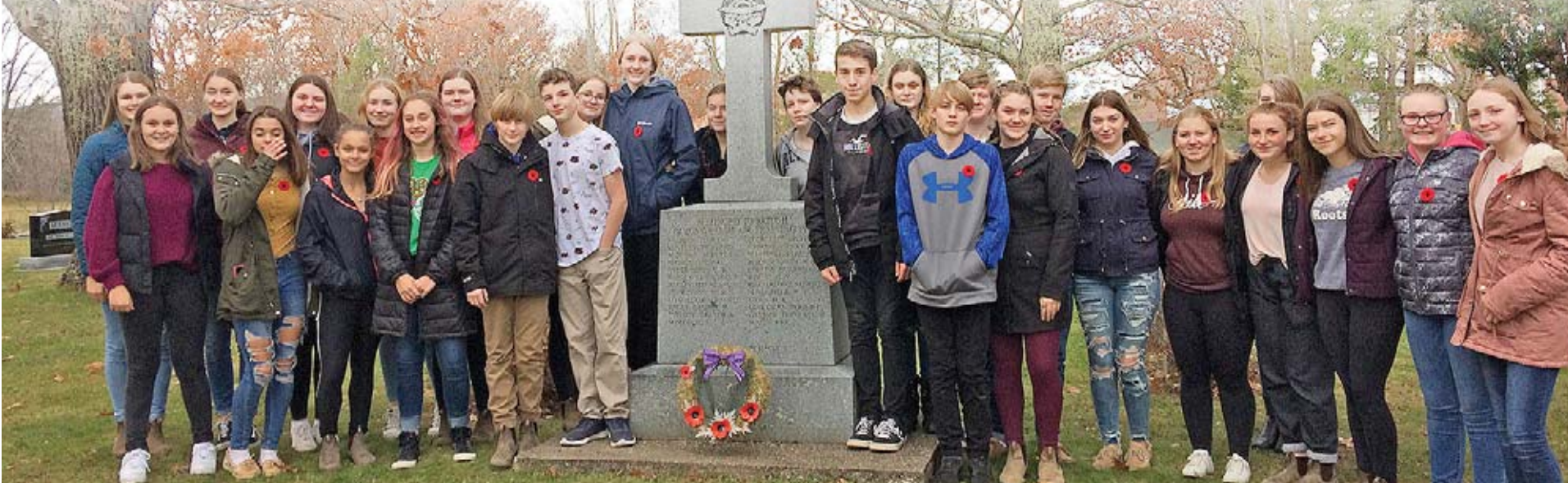
Middleton Regional High School Grade 9 students joined the No Stone Left Alone project November 5, remembering 27 airmen killed during Second World War training at Station Greenwood and buried in Old Holy Trinity Cemetery in Middleton.