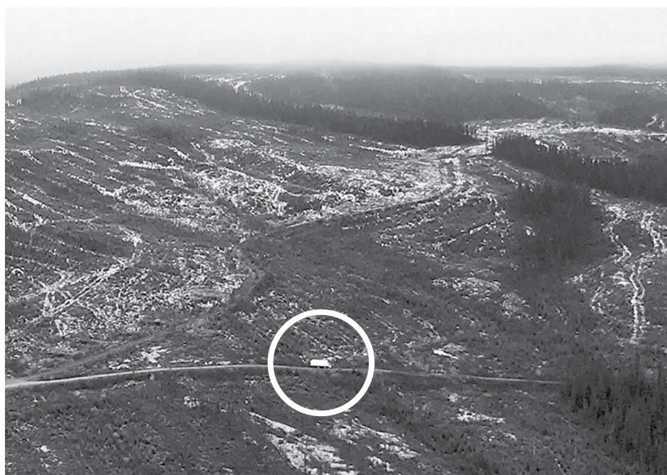
Captain M. Chevalier

October 17, just after 9 p.m., the Halifax Joint Rescue Coordination Centre tasked a 14 Wing Greenwood-based CH149 Cormorant helicopter with 413 (Transport and Rescue) Squadron to assist in the search for an overdue cube van, driving from Sept-Îles to Relais-Gabriel, Quebec, to deliver IKEA furniture to Labrador City. The crew was just landing from a training flight, and was off again just after 9 p.m. It was forced to return to the airfield just after 11 p.m.; two aircraft were subsequently tasked - CC130 Hercules Rescue 344 and CH149 Cormorant Rescue 911 - just after 8 a.m. October 18. An hour later, the Herules broke through cloud above Sept-Îles and picked its way through the mountains below the clouds to the search area. The crew followed the winding mountain roads, banking back and forth. After an hour-and-a-half of searching, the searchers found the van, clearly visible against the green hillside. After several low passes, spotters determined the van was empty.