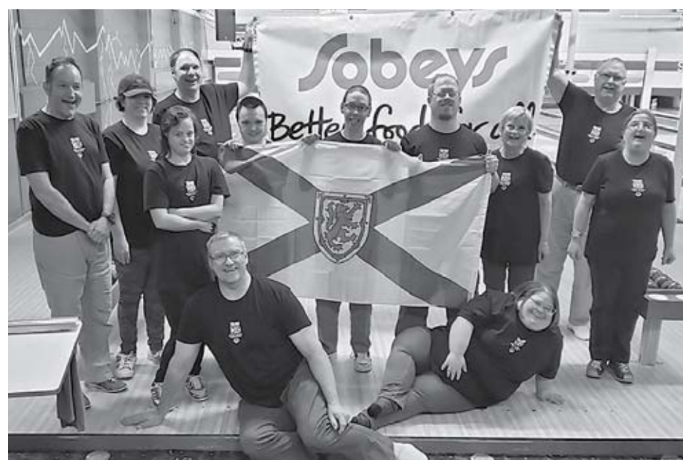
Ten Special Olympics bowlers from across the province, and their training coaches, were in Greenwood October 26 for the first of two training camps before representing Nova Scotia at the Special Olympics Canada Winter Games in Thunder Bay in February