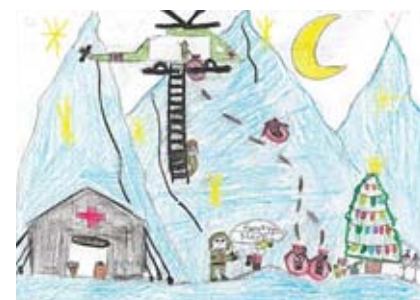
The 2018 contest winner was Isabel Broadbent, who captured military hospital and personnel spreading Christmas joy to children in Ukraine and delivering gifts.