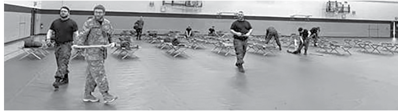
The team assembled a 50-cot shelter in the 14 Wing Fitness & Sports Centre gymnasium, with significant room to expand capacity. Submitted

ment, transport, etc. To ensure the team is ready to respond in the local area, and work out logistical and communication details, members gathered April 14 - while respecting physical distancing as much as possible. For most, this was also valuable refresher on how to set up military tents and cots. Within a few hours, the 14 Wing Greenwood Fitness