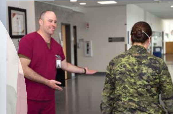
26 Canadian Forces Health Services personnel continue to offer services to military members, taking into account a detailed COVID-19 prevention procedure as they attend appointments and daily sick parade.