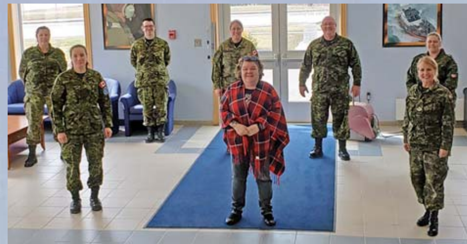
Despite restrictions imposed by COVID-19, the Wing Comptroller branch continues to work as a cohesive team, implementing and innovating creative operating procedures to close the fiscal year, while striving to continue supporting wing members. The sections supports operations through tasks including initiation and finalization of claims, cashier services and financial management services.

It's time to do your part. Spread the message, not the virus.