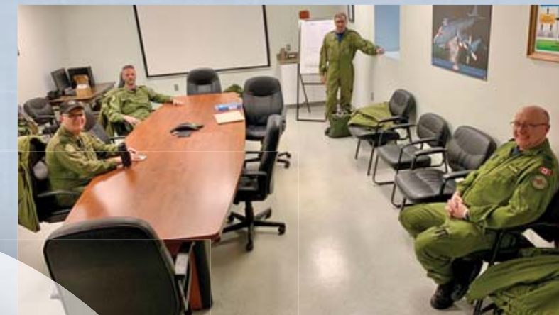
A designed crew with 415 (Long Range Patrol Force Development) Squadron continued activities at IMP Halifax Airport on behalf of AETE, for the Production Acceptance Testing & Evaluation of CP140 114, the last CP140 to undergo the Aurora Structural Life Extension Program and Residual Third Line Inspection & Repair. Testing is approximately 90 per cent complete, and the aircraft is expected back at 14 Wing shortly. The crew and the IMP personnel took great care to practice physical distancing during the brief, debrief and all other activities in between - which now seems like second nature.