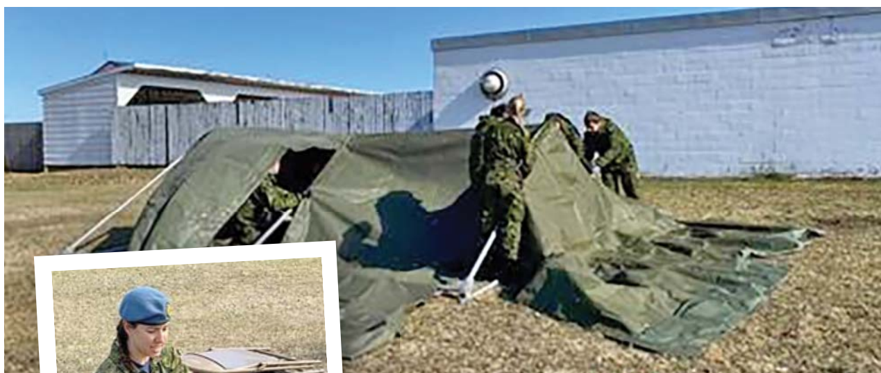
The 14 Wing Greenwood local response force practices setting up modular tents.