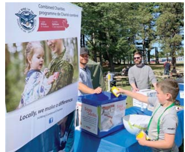
Combined Charities launched its 2020 workplace giving campaign September 12 as part of the 14 Wing Greenwood Wing Welcome REXPO event. Volunteers manned an information booth and freewill offering BBQ, and also started their "Soup & Socks" collection.

There will be more events and opportunities in the weeks ahead; as you can imagine, planning with all the COVID-19