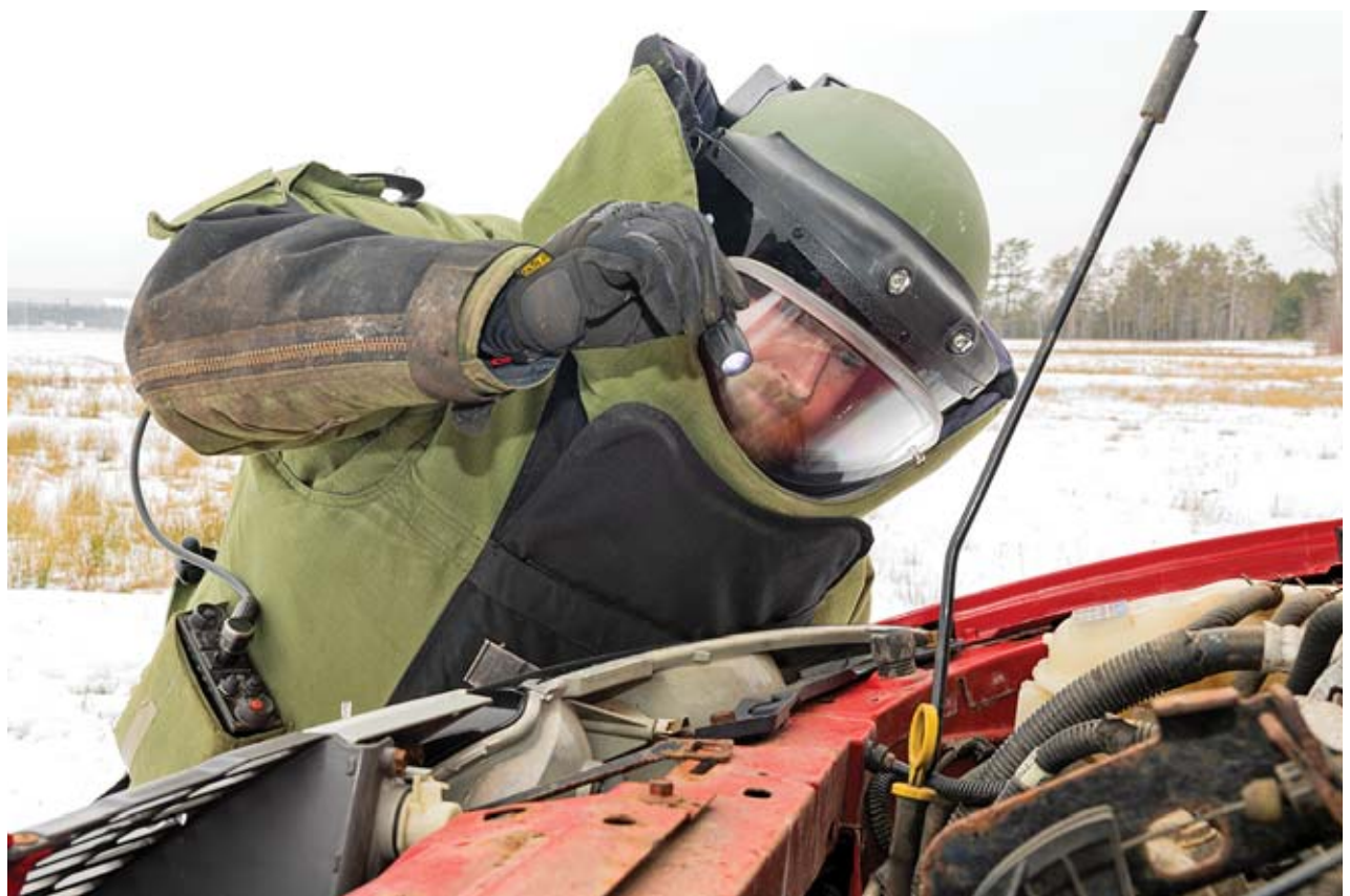
An improvised explosive device disposal operator from 14 Wing Greenwood's Explosive Disposal Flight inspects the engine compartment of a suspicious vehicle during a recent training scenario.

"Some gamers have demonstrated the ability to adapt quickly to the TEO console – they're sometimes naturals, but it does take some getting used to. The work you're doing is sometimes very, very