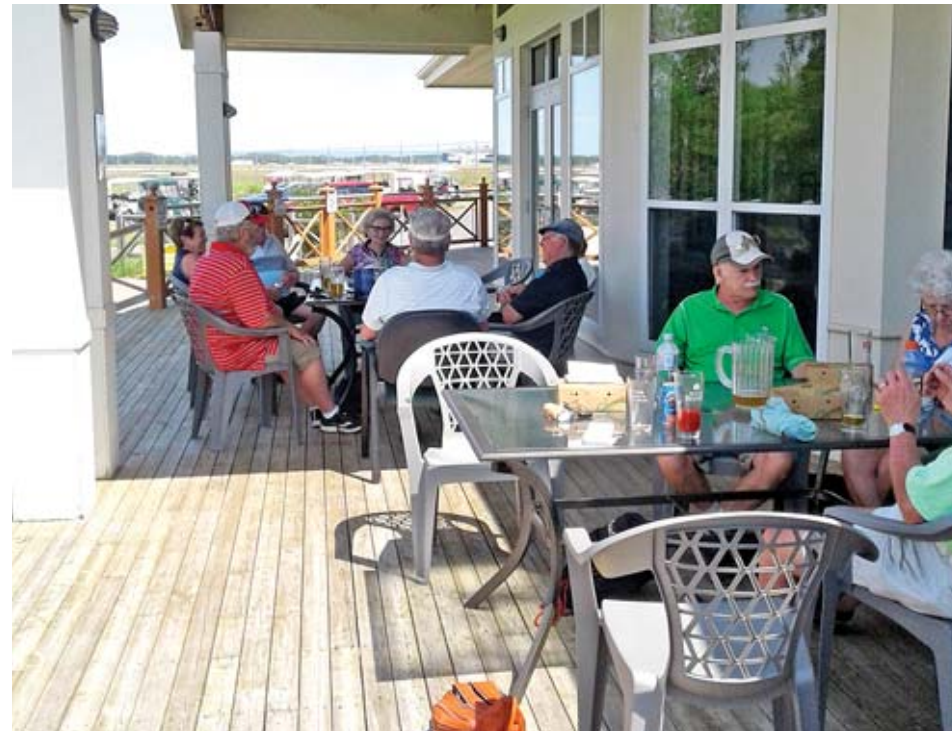
The Greenwood Golf Club deck is a great place to treat a friend to lunch after a round. Outdoor activity on the course is well underway.

Hit 'em long and straight, keep up the pace of play and enjoy your round of golf! →