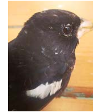
Listen for me – do you know who I am? Submitted