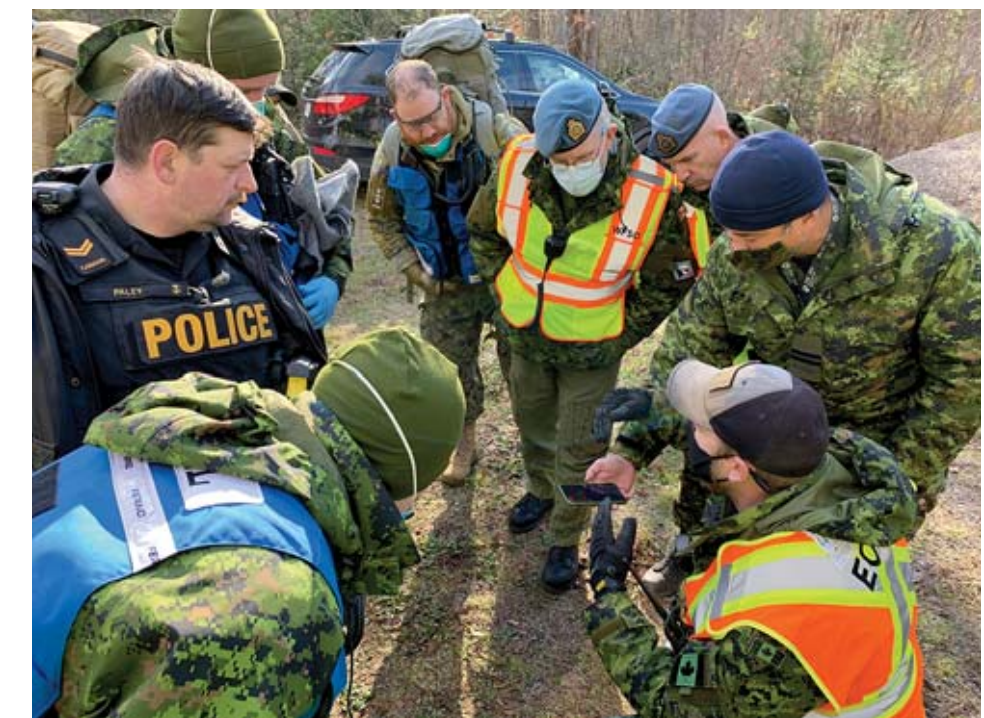
While the wing stood up a 30-person search team, early scene responders assembled for a quick woods search for the CF18's missing pilot.