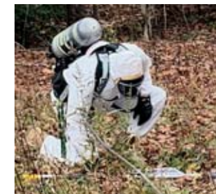
Once the fire was out, next on scene of the downed CF18 is the wing's Explosives Ordnance Disposal team.

has done its work. Fire tells EOD what they saw. Everyone's going through their checklists."