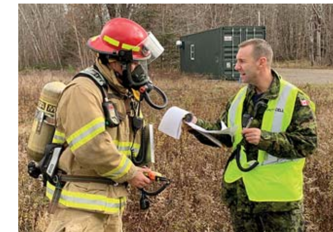
14 Fire and Emergency Services' members makes some decisions in its crew's response to the crash call.