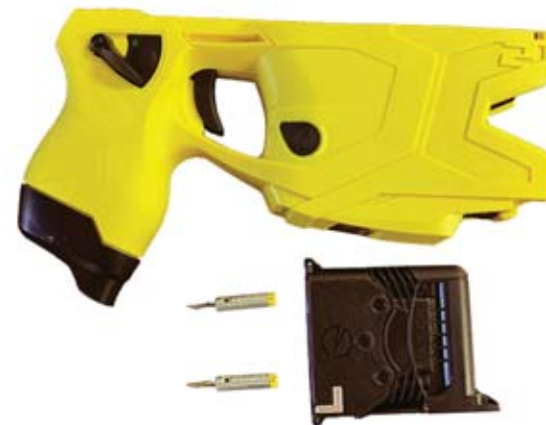
The features and parts of the newest piece of equipment at 14 Wing Greenwood's 24 Military Police Flight: conducted energy weapons.

Si un officier décharge l'AI, celle-ci libère 28 petites étiquettes d'identification en confetti. L'AI peut également être branchée à un ordinateur afin d'examiner tous les chronométrages, les boutons enfoncés, l'utilisation des fléchettes, les impulsions et la durée. Toutes ces informations peuvent être utilisées comme preuves et montrent que les agents ont utilisé l'outil correctement.