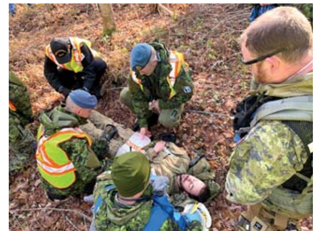
26 Canadian Forces Health Services medics prep the injured CF18 pilot for a woods hike to hospital care.

port to the crash site; Oscar moved to Plan B, gathering available on-site responders into a nine-member quick-search team. With a medical team and supplies, they headed into the woods, keeping in mind safe zones from burning contaminants as they worked to where the parachute had been spotted hours earlier.