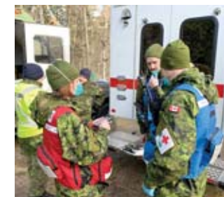
26 Canadian Forces Health Services responders pack up essential supplies.

By 11 a.m., a ground search and rescue team was requisitioned, provisioned and being prepared for trans-