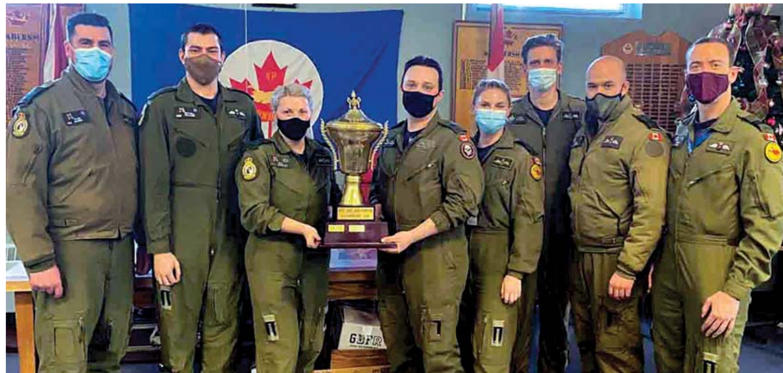
405 (Long Range Patrol) Squadron's Crew 2, holding the Pathfinder Cup after winning the challenging squadron-wide competition.

The 2022 Pathfinder Cup took place during a cold