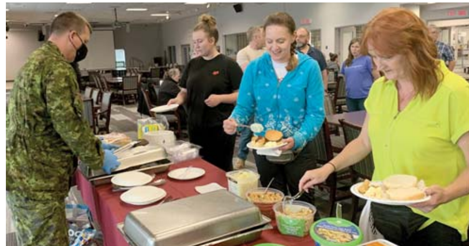
14 Wing Greenwood marked National Public Service Week June 12 to 18, inviting civilian workforce members of the local Defence Team for a BBQ lunch.