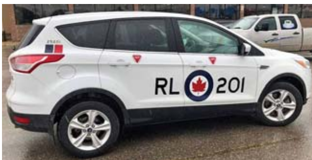
Winnipeg drivers should keep an eye out for this Ford Escape a la Avro CF105 Arrow. CanMilAir Decals