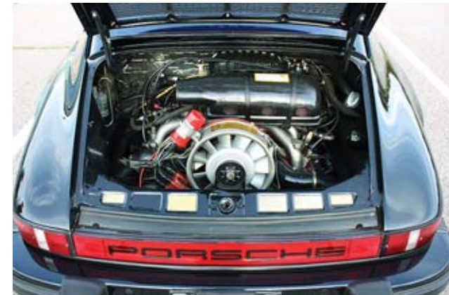
This modified 3.0 litre air-cooled flat six cylinder engine produces about 220HP - or about one horsepower for every 10 pounds of steel.

Local Porscheophile Larry Burbidge's 1976 3.0 litre 911 Carrera is just the sort of rolling artwork that would