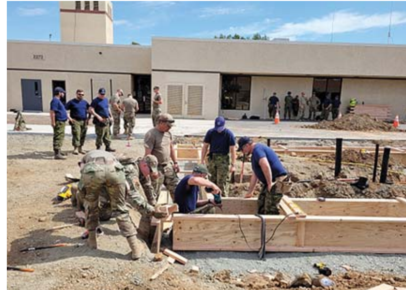
Several members of 14 CES and 107th Civil Engineer Squadron working together on the footings for a restroom area at March Air Reserve Base CA.