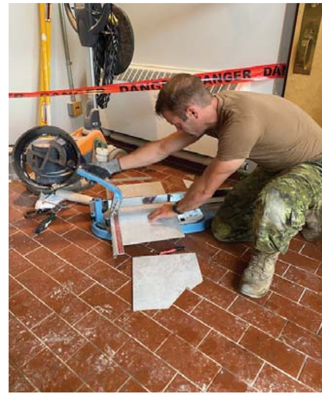
14 Construction Engineering Squadron personnel are adding the finishing touches to a major renovation of the men's restroom in the Queen of Heaven Chapel, a project started during the Canadian component of a work exchange with over 100 members of three United States Air Force engineering squadrons this summer.