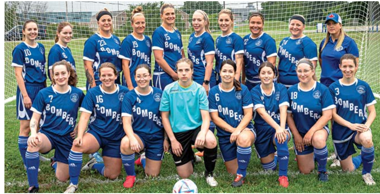
14 Wing Greenwood's Bombers were the host team at the 2022 Atlantic Regional women's soccer tournament, making it to the semi-final game and losing to eventual title winners, CFB Gagetown.