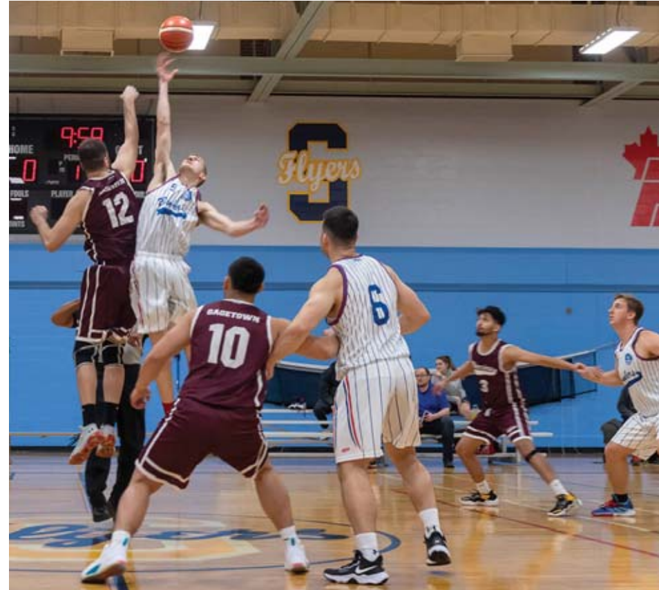
14 Wing Greenwood's men's basketball team finished third at Atlantic regionals – but came out of the week of action inspired by some defining, cohesive moments that show promise for next season's program.

Despite round-robin losses against Gagetown (78-56) and Halifax (76-29), Greenwood still finished third overall with a 68-43 win over 12 Wing.