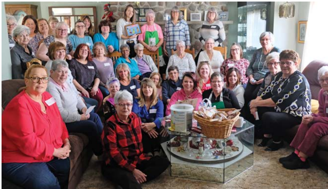
Several dozen ladies - the "Angels Among Us" - took a breakfast social opportunity to put their fundraising support behind a playground project for the Valley's Chrysalis House.