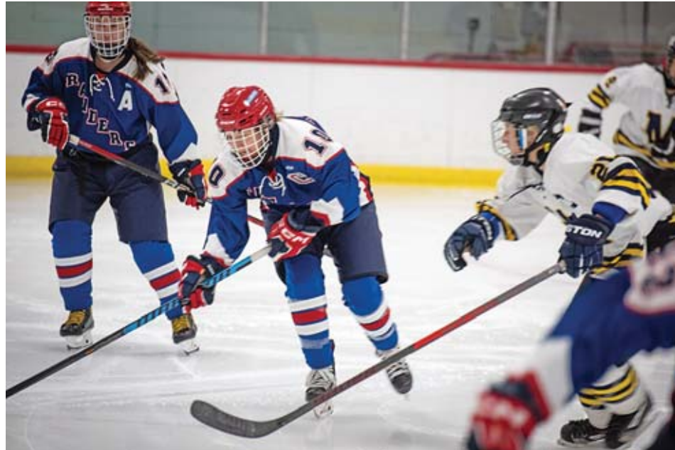
The Greenwood women opened the Atlantic region championships on home ice February 14 against the Halifax Mariners, eventual title winners.

"Welcome to our friends from Gagetown and Halifax.