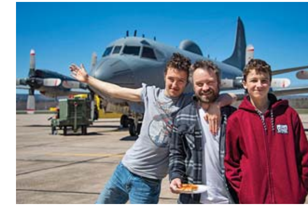
Stingers large and small, old and young, in uniform and part of the military family gathered in 10 Hangar, 14 Wing Greenwood, the home of 14 Air Maintenance Squadron; for a squadron family day May 7. Family days are an opportunity to see some of the workspaces and equipment squadron personnel use day-to-day – and have fun!

Master Corporal JR Chabot, 14 Wing Imaging