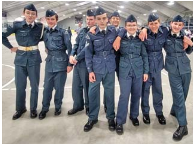
Members of the 517 Flight Lieutenant Graham Royal Air Cadet Squadron drill team, non-drilling after their participation in the 73rd Annual Ceremonial Review June 10 in Kingston.